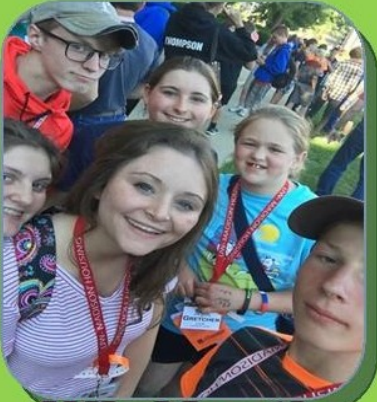
WI Youth Conference