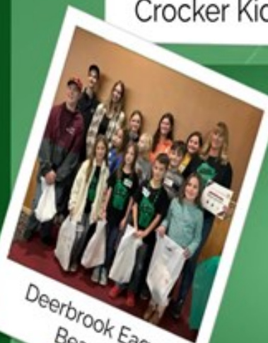
Deerbrook Eager Beavers