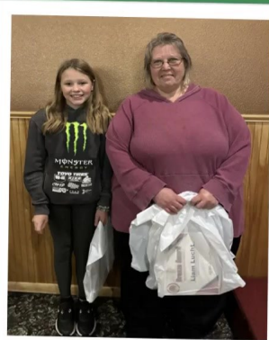
Neff Switch Acorns